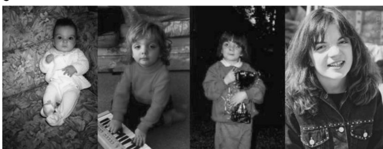
\label{eq:stars} Fig. 1. Serial photographs of three patients with the 11q terminal deletion disorder. A: Ages 3 months, 2 years, 4 years, and 10 years; (B) ages 5 weeks, 7 months, 5 years, and 5 years; (C): ages 9 months, 2 years, 6 years, and 14 years.